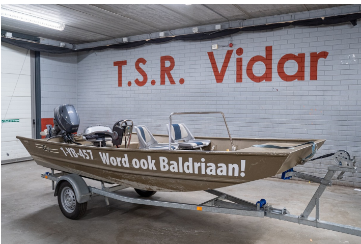
There is also the possibility to rent our launch.