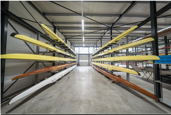
The boathouse indoors.