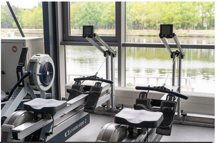
The gym has got 14 rowing machines.